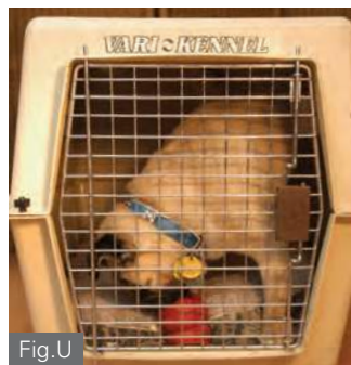
Fig.U: To extend the meal when not using a MannersMinder, give the dog a bone or provide a filled Kong.

Fig.S,T: To adapt the MannersMinder for dispensing into crates, remove the food bowl and fold two 3 x 5 index cards and attach them with tape to form a chute. Treats can be dispensed using a remote control or the MannersMinder can be switched to automatic so that it dispenses at a rate that you set.