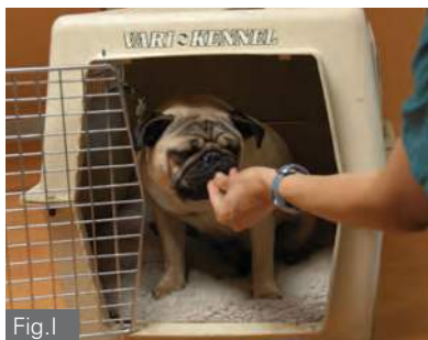
Fig.I: Start by giving treats in rapid succession, quickly enough to keep him inside. Then slow the rate of giving so that he learns to wait in the crate for 3-5 seconds between treats.