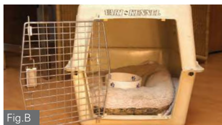
Fig.B: When he's comfortably eating his meals in this new location, move the food just inside the crate so he has to stick his head in to eat. If he's the type of dog who will get scared if he hits the door when going in or out, start with the door removed from the crate.