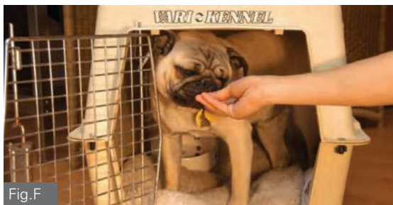
Fig.F: Once he's finished with his meal, give him several treats (or kibble) in a row to encourage him to wait in his crate rather than dart out. If the dog is the type to dart out, shove the treat right into his face so that your hand and the treat act like a stop sign blocking his exit.