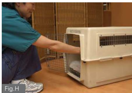
Fig.H: When giving the treat, reach into the crate and put the treat all the way up to the dog's face, so that you don't accidentally make him come forward out of the crate to get it.