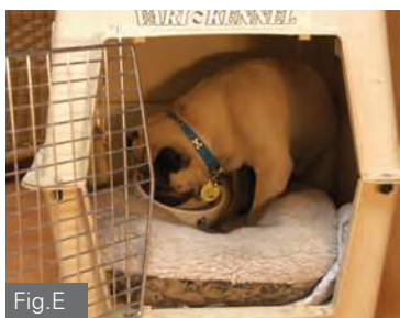
Fig.E: For most dogs, reaching this point takes less than 3 days of twice-daily feedings.