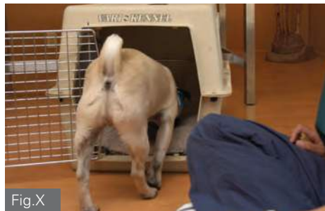
Fig.X, Y: Once the dog goes inside, toss more treats to the back. You’re trying to teach him to stay in there and wait for you to toss more treats.

Fig.W: Practice training this cue word randomly throughout the day by walking with the dog toward his crate and saying “kennel” or “crate” right before tossing a treat inside. Say the cue word before you toss the treat so he learns that the word predicts his chance to earn a treat by running into the crate. Alternatively, you can hold his collar so he doesn’t have a chance to run into the crate until after you say the cue word, followed by releasing his collar.