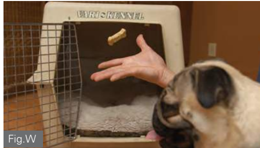
Fig.W: Practice training this cue word randomly throughout the day by walking with the dog toward his crate and saying “kennel” or “crate” right before tossing a treat inside. Say the cue word before you toss the treat so he learns that the word predicts his chance to earn a treat by running into the crate. Alternatively, you can hold his collar so he doesn’t have a chance to run into the crate until after you say the cue word, followed by releasing his collar.

Fig.V: Once the dog anticipates crating by running in as soon as he sees you bring food, teach him the cue word “kennel” by keeping him outside the crate until you put his meal in it. Hold his collar so he can’t get into the kennel. Next, say “crate” or “kennel” right before you release your hold on his collar and let him run into the crate.