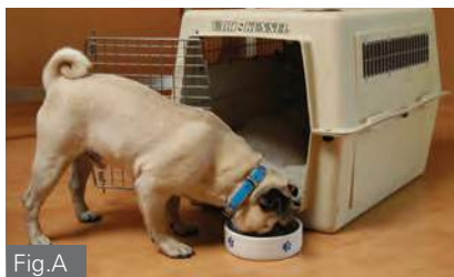
Fig.A: If the dog really dislikes being confined, start by feeding his daily meals just outside the crate.