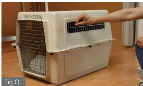
Fig.Q: Dogs who vocalize in the crate should be rewarded intermittently for being calm and quiet instead. Hang out near the crate and periodically toss treats inside (perhaps do this while you are watching television). Then systematically increase the interval between treats so that you can use fewer and fewer treats. Also, gradually increase your distance from the crate. The dog should eat the treats immediately; failure to do so indicates that the dog is anxious or not hungry and the food is no longer a reward.

Proper crate training helps prevent the development of anxiety and barking when dogs are separated from their owners by a barrier or left alone in the house. For some dogs, the pleasant association already established with the crate is enough to teach them to remain quiet and calm when left in it. For others, as soon as they finish their meal or Kong toy, they start to whine or bark to be let out. These dogs must be specifically trained to be quiet in the closed crate. It's not enough to just have treats in the crate and hope their pleasant experience allows them to rest quietly in the closed crate at all times.