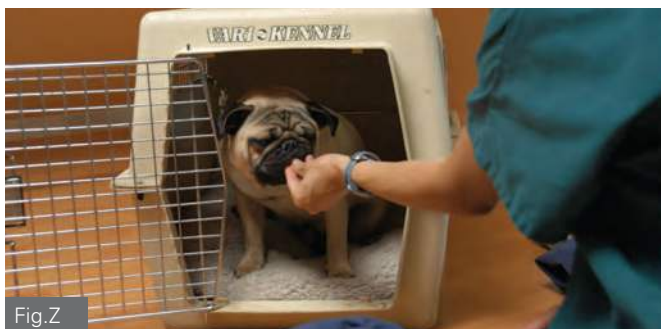
Fig.Z: Once he turns around to face the crate door, give him treats for sitting or lying patiently inside. Increase the interval between treats so he learns to wait longer to get his treat.