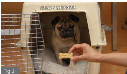
Fig.J: Between treats, your treat-holding hand must be far enough from the dog that you're not luring him out. Try tossing the treats or kibble in to him. If he reaches for the treat when you're holding them outside the crate, pull the treat away quickly so that it's clear to him that he doesn't get it.