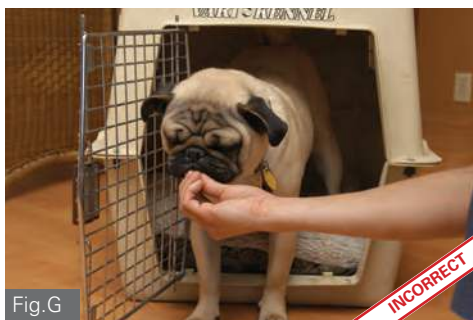
Fig.G, Incorrect: If the dog is coming out of the crate, either you aren't reaching in far enough or you're delivering the treat too slowly, which makes him think you want him to grab it.