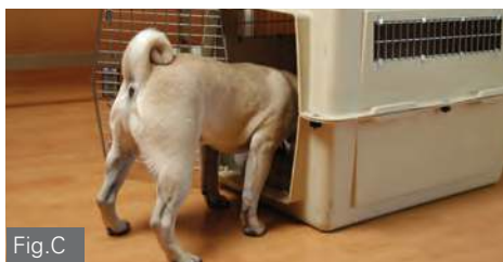
Fig.C: The dog should readily stick his head inside the crate. If he's comfortable, he'll eat his entire meal without backing out to look around.