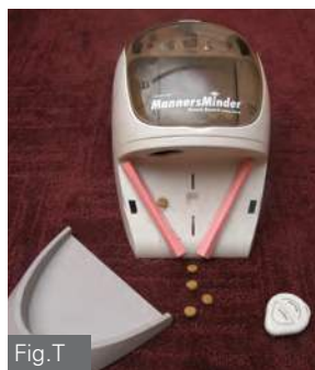
Fig.S,T: To adapt the MannersMinder for dispensing into crates, remove the food bowl and fold two 3 x 5 index cards and attach them with tape to form a chute. Treats can be dispensed using a remote control or the MannersMinder can be switched to automatic so that it dispenses at a rate that you set.