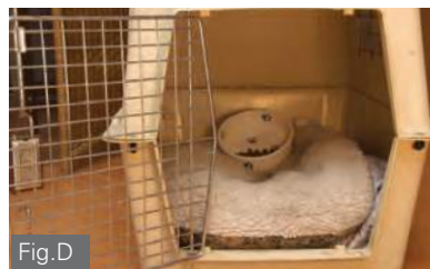
Fig.D: Gradually move the food dish farther inside the crate until the dog easily goes all the way into the crate.

*To see video depicting this protocol go to www.AskDrYin.com .